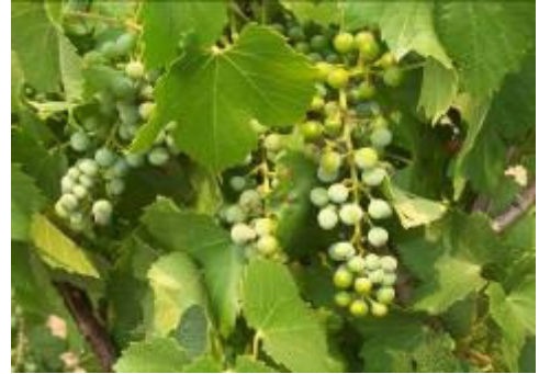
Poor berry set

Do you need to improve fruit set in your wine grapes? Would you like to enhance colour or fruit uniformity? Would improving drought tolerance and nutrient accessibility be an advantage? Do you need a product with organic certification that can be applied at any time of the year?